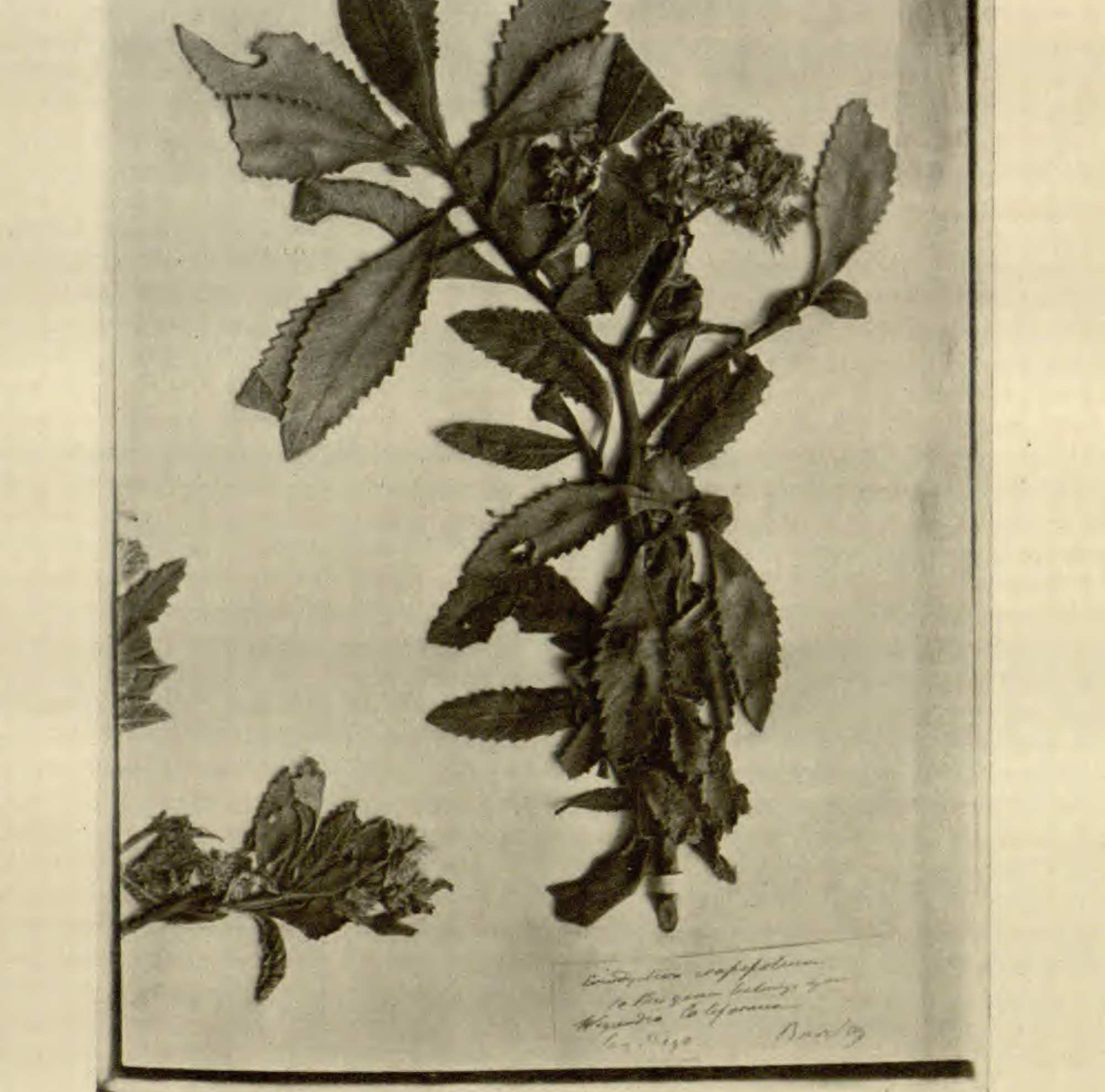
FIG. 1.— Eriodictyon crassifolium Benth.: type specimen in the Bentham Herbarium at Kew Gardens.

sprung from a common stock is also evident, for, as we shall show, there are forms still existing that comprise an almost unbroken series from the glutinous to the tomentose type.